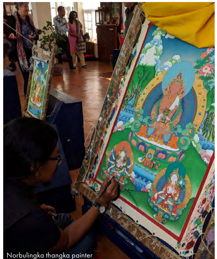
Norbulingka thangka painter