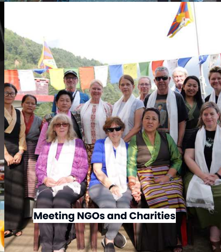
Meeting NGOs and Charities