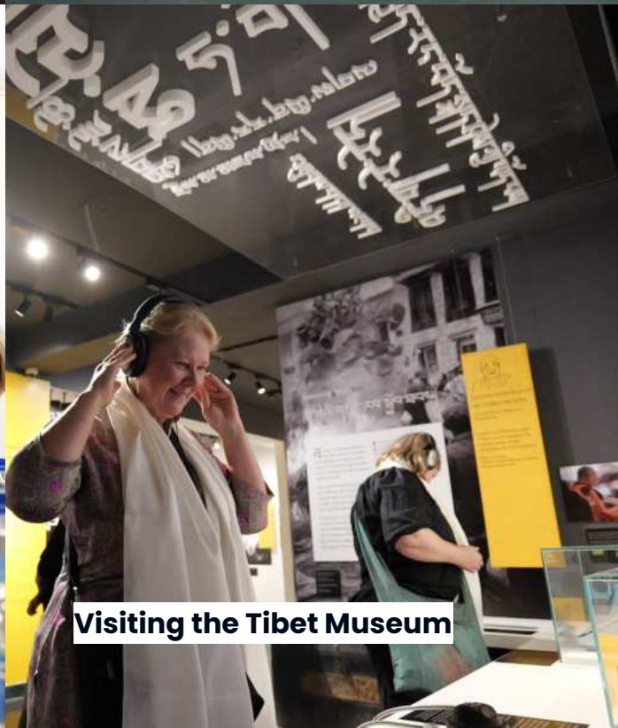
Visiting the Tibet Museum