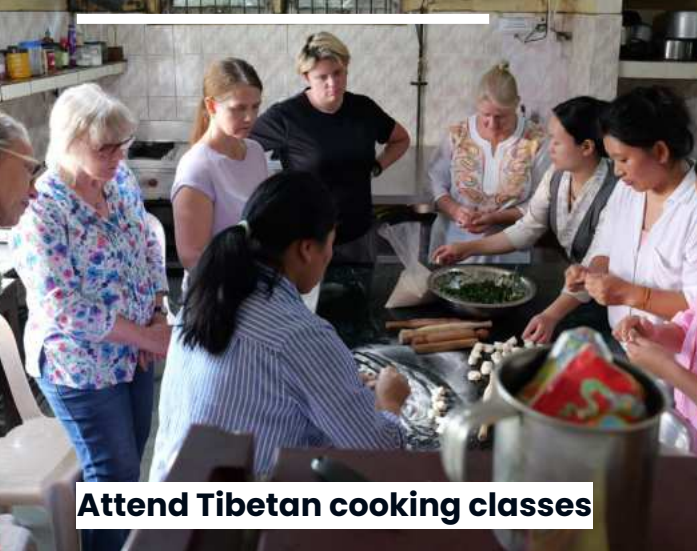
Attend Tibetan cooking classes