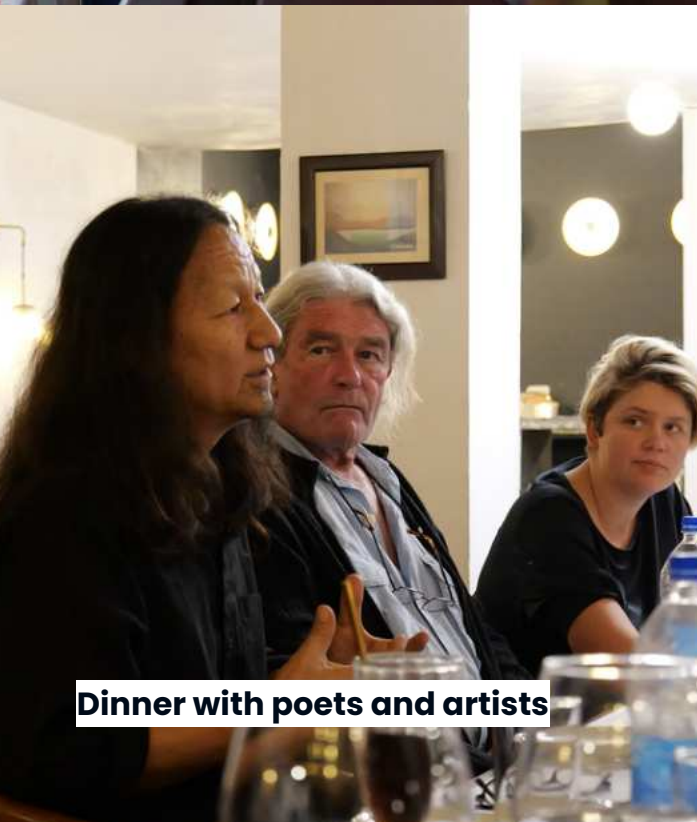
Dinner with poets and artists