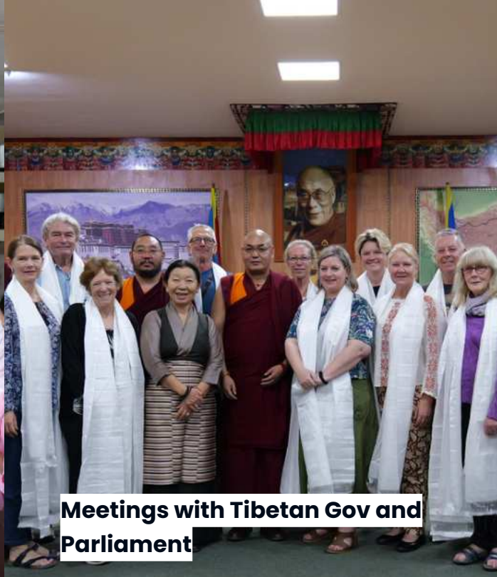
Meetings with Tibetan Gov and Parliament